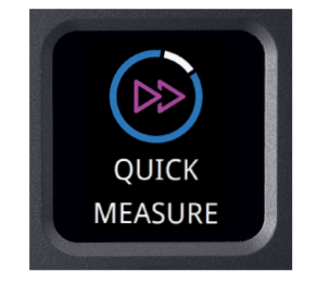
Quick Measure A fast measuring mode for challenging patients