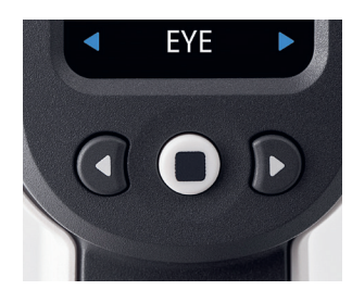
iCare EasyNav Advanced navigation interface