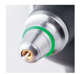
iCare EasyPos Alignment indicator: green confirms tonometer positioning