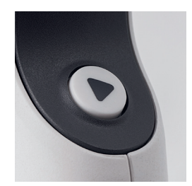
iCare AMS Dual-mode operation (single or rapid 6-series measurement)